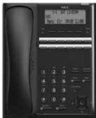
12 Button Digital Telephone