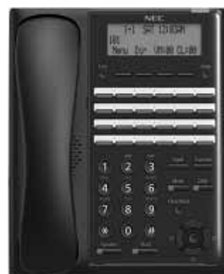
24 Button Digital Telephone